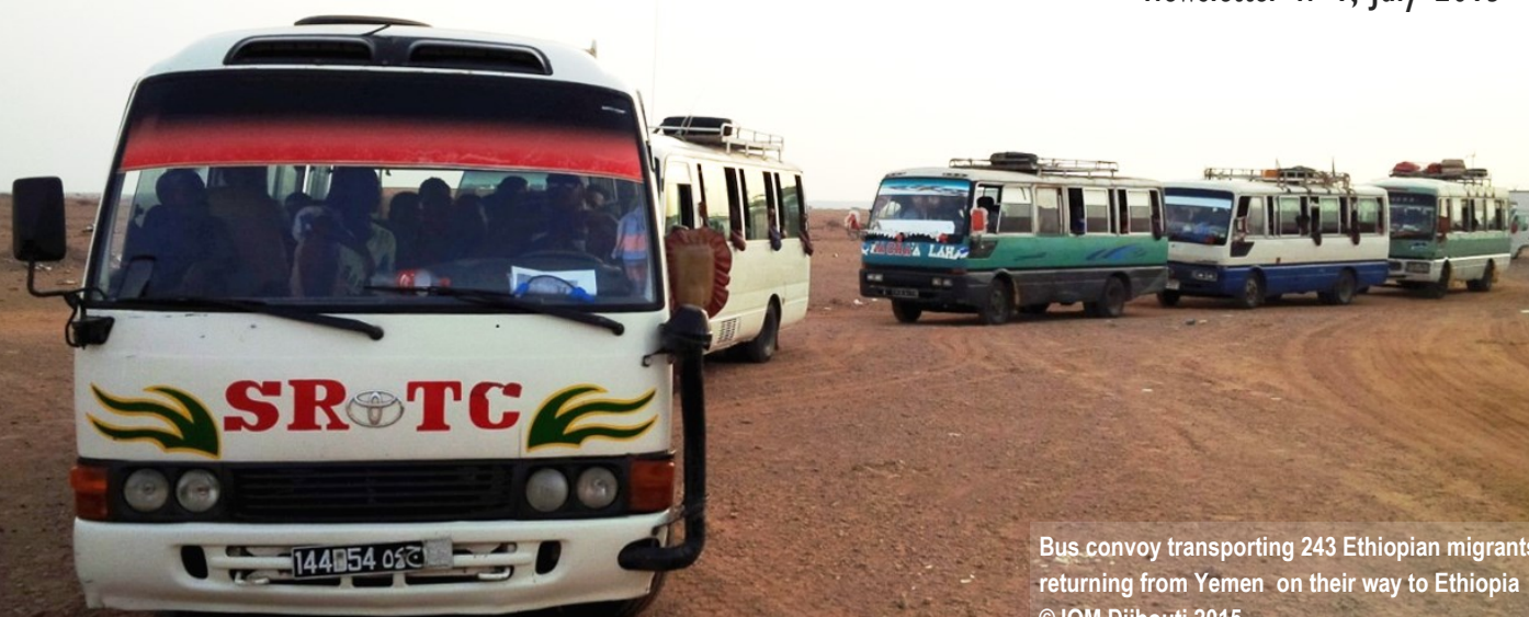
Bus convoy transporting 243 Ethiopian migrants returning from Yemen on their way to Ethiopia