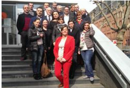
Participants and Organizers of the Seminar in Frankfurt in March 2014